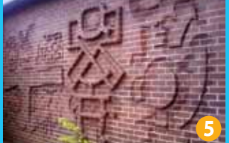
Untitled Harold Balazs • Brick. 1969