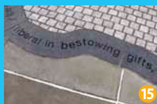
An Evocation Ellen Sollod • Granite. 2010