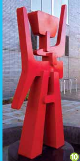
There is a Whale Inside Me Troy Pillow • Stainless steel, paint. 2010