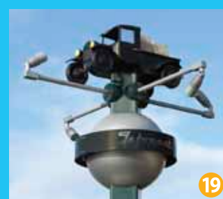
Model T Kiosk Peter Reiquam • Steel, aluminum. 2005