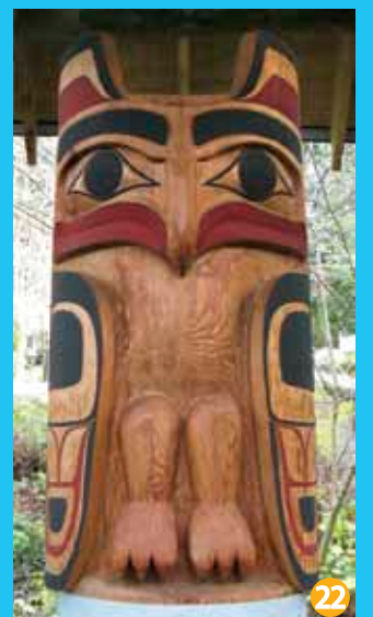
Eagle Galen Willis • Cedar, paint. 2011