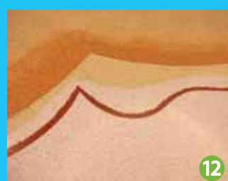
Untitled (Terrazzo Floor) Paul Marion • Glass, concrete. 2009