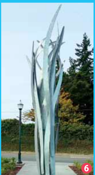
Forest Illumination (2 Pieces) Julie Berger • Steel, metal, glass. 2009